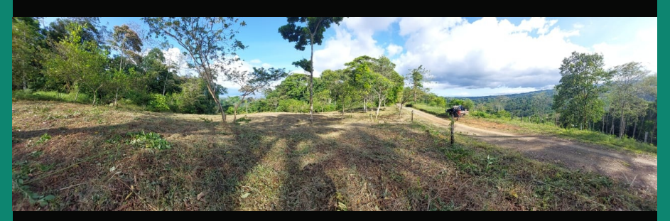
Don't forget to take a look at our VIDEO!