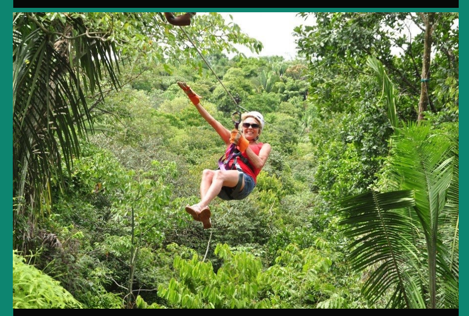
Call or write today for more information or to schedule your showing, and thank you for your preference. Osa Pen Realty, after all, remains YOUR KEY TO PARADISE!