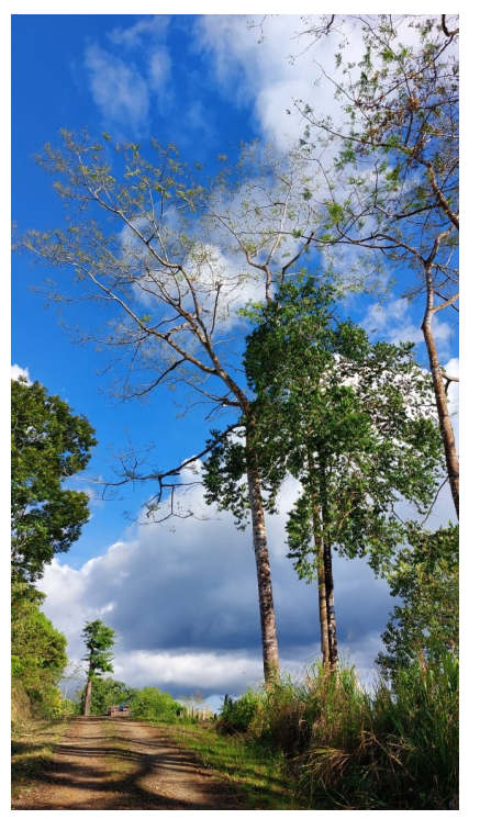
This is Forestry Reserve, 3 km from the power grid, so solar power only at this point, and has its own internal water. It is owned in a corporation, all of it for sale, or segregations offered on a case-by-case basis.